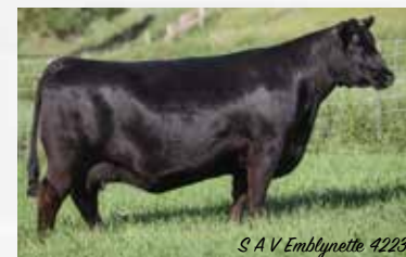
SAV Emblynette 4223

Dam SAV HARVESTOR 0338 SAV EMBLYNETTE 4223 SAV EMBLYNETTE 1786