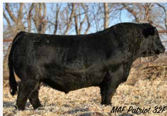
MAF Patriot 32F Sire