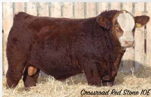
Crossroad Red Stone 10E Sire

A dark cherry red, powerful, baldie Red Stone son that will be sure to catch your eye. He was pointed out regularly in the summer by visitors. He has big time performance with huge weaning and yearling weight EPD's both in the top 2%. 187H is long bodied with lots of hair, muscle and depth of body. His Red Mountain dam is big bodied and good uddered. We are calving out the first Red Stone females now and they have very good udders and are hairy and powerful. If you wonder what the females are like, have a look at the Red Stone females on offer. He should make some powerful and impressive offspring with that much wanted money strip.