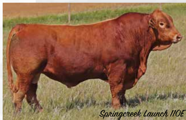
Springcreek Launch 110E Sire

The most powerful red bull of the offering. This bull is dark red, heavy muscled, heavy haired and exhibits lots of maturity and presence. He has excellent balance and softness with extra length and lots of bone. A bull that offers big time weaning and yearling weights along with strong milk and maternal calving ease numbers. The Launch * Horizon combination has been a powerful one. Our high selling red bull last year, MAF Motion 143G, would be a \frac{3}{4} brother to this bull.