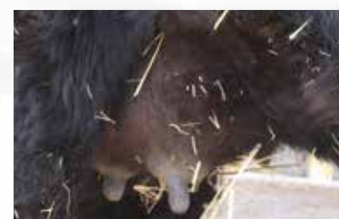
Exclusive Daughter's Udder

Dam MR CCFVISION MAF POCAHONTAS 18F MAF POCAHONTAS 135D