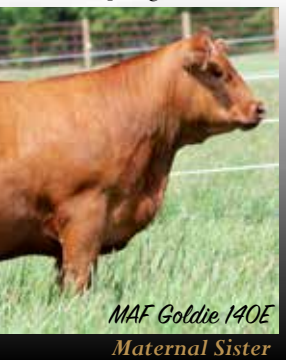
MAF Goldie 140E

Likely the longest bodied of the full brothers. 15H is dark red and stays consistent and true to the flush with nice muscle pattern, depth and overall completeness. We will be breeding the first Patriot daughters this spring and if you are wondering what their potential will be, have a look at the open heifer section. They are sure to impress and are maturing into beautiful, very functional females. These bulls are sure to breed true with the cow families that are combined in their pedigree.