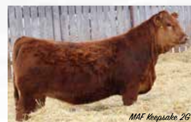
MAF Keepsake 2G Maternal Sister

Another powerful blaze face Red Stone son. He is deep bodied, stout, with lots of shape and long as they come. His maternal sister sold last year to Maple Lea & Bristol View Farms. A terminal type of bull that offers weaning and yearling weights in the top 2% of the breed. If you want to add a blaze face to the calves you sell in the fall that will weigh up well, have a look here.