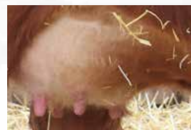
Launch Daughter's Udder

This bull has the excellent head carriage that we appreciate about the Launch sired animals. If you look through this group, you will see that they are all proud and masculine in their design. 82H has awesome hair, is long bodied, stout made and deep bodied. A good bull, out of a Royal Red dam, who has been a strong producer, this being her first bull calf. His dam would be the granddam of the Lot 64 bull.