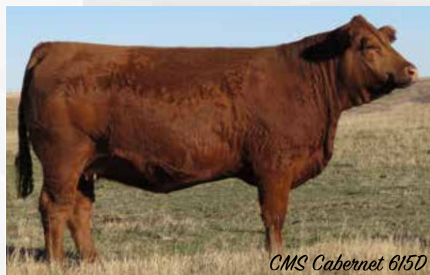
CMS Cabernet 615D

An impressive Launch son to lead off the sire group! 66H is powerfully constructed and very complete. You really have to appreciate his muscle expression and overall softness. He is wide topped and big middled. The bottom side of his pedigree is a different twist for our program. His dam we purchased from Czech Mate Simmentals, a good uddered, productive Current Affair daughter. This bull offers a lot of maternal strength with strong EPD's and pedigree.