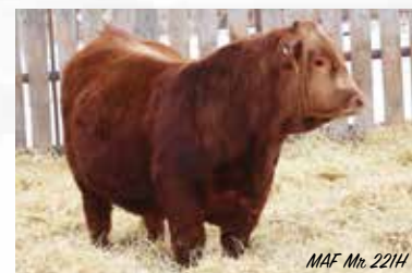
MAF Mr 221H Front View

The coolest made Launch in the offering. This mid February bull's profile will be sure to catch your eye and when you get behind him, he has thickness, depth of body and big rib shape. A bull that has character and presence to him. 221H is very sound, has lots of hair and is clean in his lines. His dam is a Red Rocket ET out of our 2W Exciter donor cow that is proving herself early on as you can see with this bull. A bull that combines a moderate birth weight and a strong EPD profile.