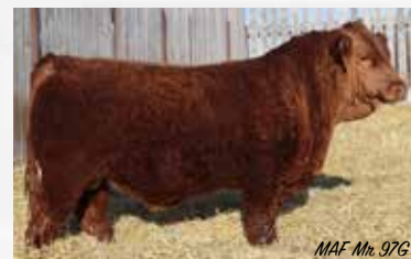
MAF Mr 97G Full Brother