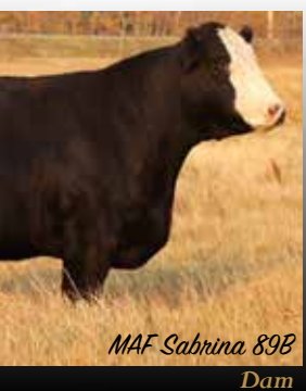
MAF Sabrina 89B Dam

This full brother would be the heaviest haired and the largest framed of the flush brothers. He is long bodied, thick and has a nice maternal look to him. He should sire moderate, thick made, good looking offspring. The full sisters to these bulls are beautiful. Two of them are in the girl's show pen and halter broke and waiting for some shows to happen this year. It was tough on the girls last year not having any shows. They both love it! We look forward to the girls showing them this summer in Portage at the YCSA show, fingers crossed! I'd keep all the heifers off a bull with this pedigree.