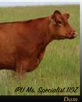
IPU Ms. Specialist 119Z

These brothers all pack a big punch and exhibit length of spine. 99H is heavy haired, wide topped and full of muscle, middle and soft in his design. This brother is easily identified by the white star on his face. He is soggy made and very complete. 119Z's progeny always pack a punch of performance and the daughters are broody with excellent udders.