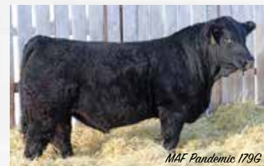
MAF Pandemic 179G Maternal Brother

Dam LFE THE RIDDLER 323B MAF FANCY 88E MAF FANCY 70B