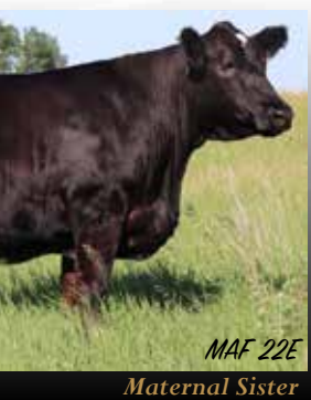
MAF 22E Maternal Sister

This flush was an excellent one and we have these 4 full brothers, plus another brother that was going to be a true sale feature, but due to an injury we are going to retain and hope to use a bit ourselves. This bull is stout, clean made and moderate framed. A strong EPD profile and pedigree backs this guy up.