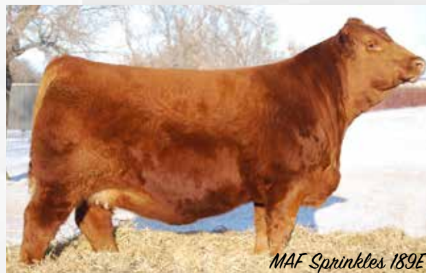
MAF Sprinkles 189E Full Sister to Dam

143H is a loose made, dark red, hairy bull that stays true to the type and kind of the Launch sire group. A bull that is long spined with lots of depth of body and is thick. This Launch * Horizon combination continues to produce the right kind of bulls that will produce the right type of cattle for many operations, providing both maternal and terminal benefits. His dam is a full sister to our Sprinkles cow that has a daughter that is a head-lining donor at Rainbow River Simmentals.