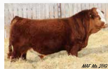
MAF Mr 211G Maternal Brother

Dam WHEATLAND BULL 47X MAF 47X TARA 152X 18Z SPRINGCREEK TARA 152X