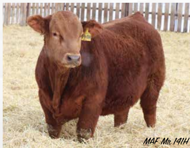
MAF Mr 141H Front View

A powerful Epic son that we really like. He is soggy made with big sweeping rib shape and long bodied with tons of depth. He is good footed, as is his dam and completes the package with a strong set of EPD's. The Noremac cow family is one of the most powerful here and excellent producers. His dam is 11 this year and she is still productive and sound. This bull will bring power and maternal qualities to any herd.